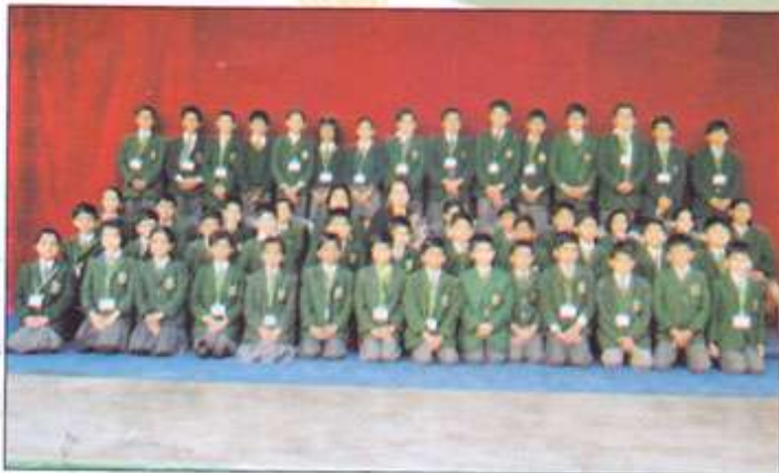
Class - 3 (A)