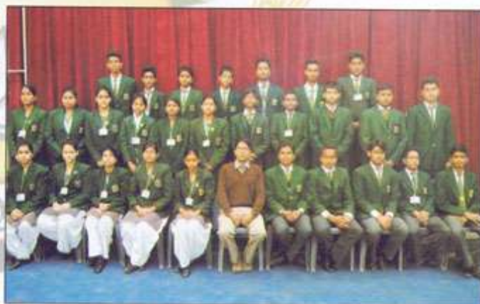
Class - 11 (Com B)