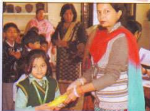
Inter School event at Mona Convent