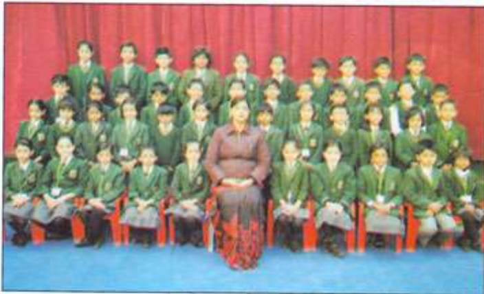
Class - 2 (A)