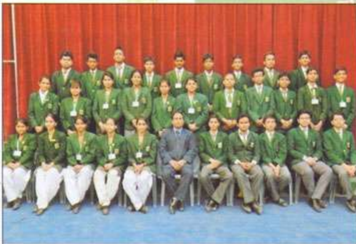
Class - 12 (Commerce)