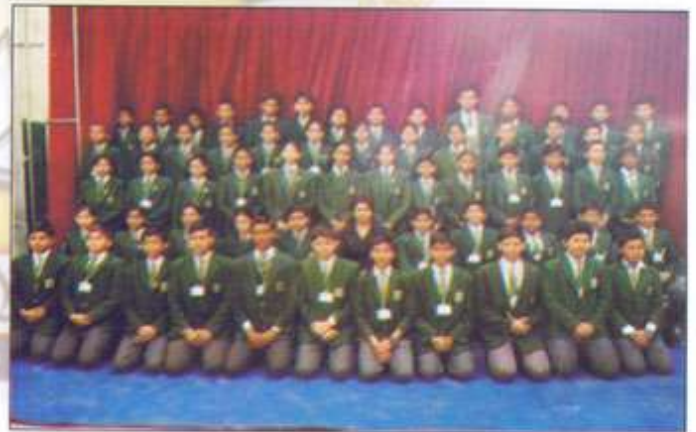
Class - 9 (B)