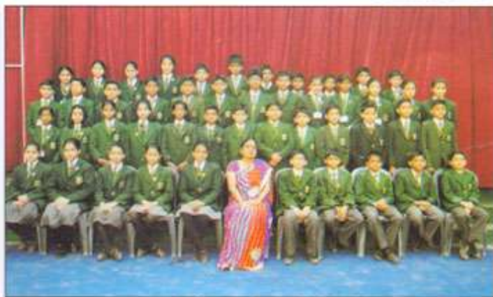
Class - 6 (A)