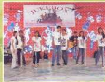
Juke Box 2012