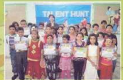
Inter School Talent Hunt