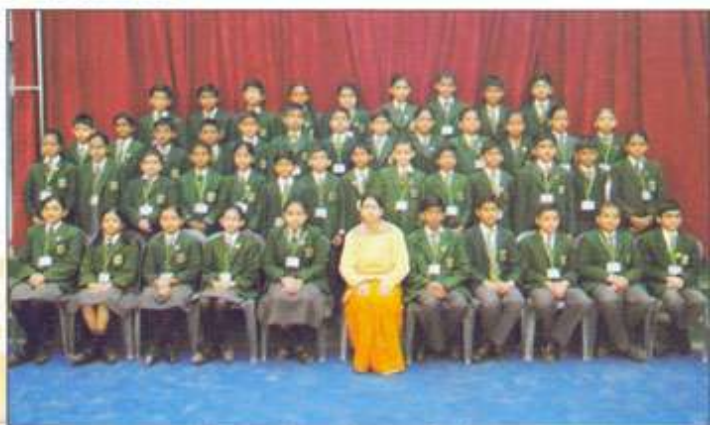
Class - 6 (B)