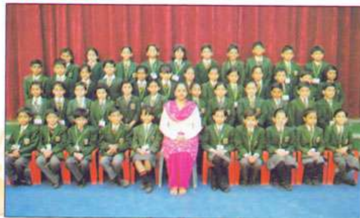
Class - 2 (B)