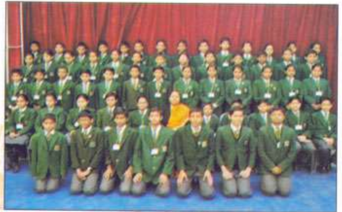
Class - 8 (B)