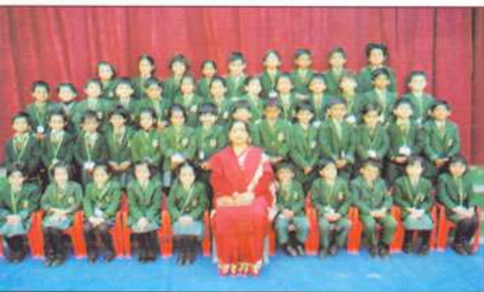
Class - Prep (A)