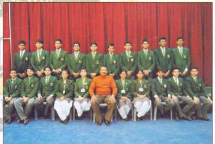
Class - 12 (Science)