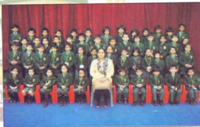
Class - K.G. (B)