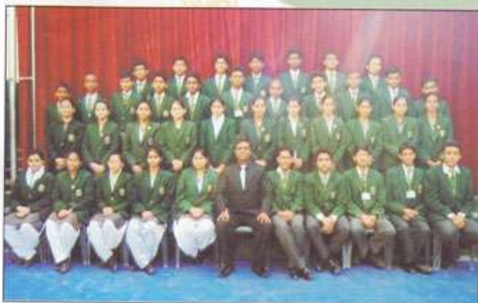
Class - 11 (Com A)