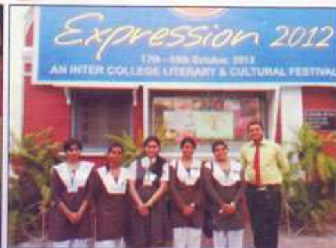
Inter School event at St. Francis College