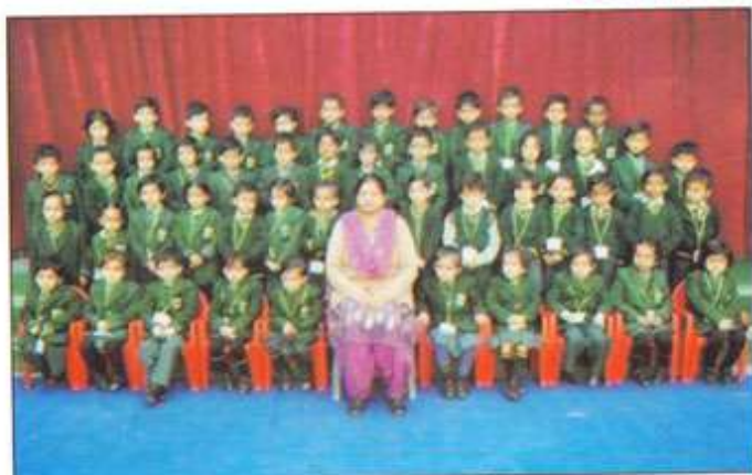
Class - Nursery (A)