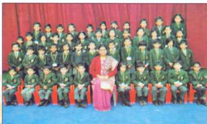
Class - Prep (B)