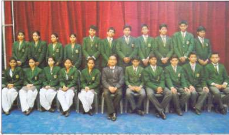
Class - 11 (Science)