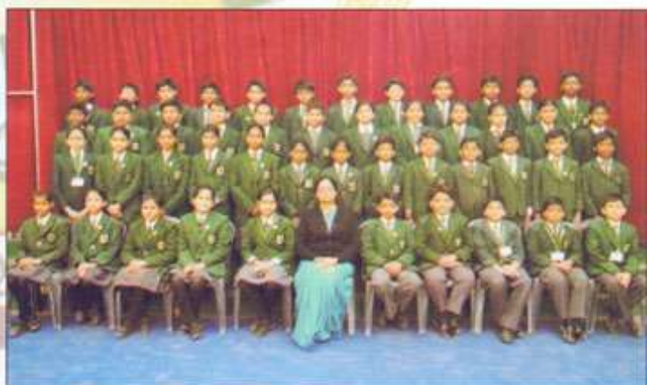
Class - 7 (B)