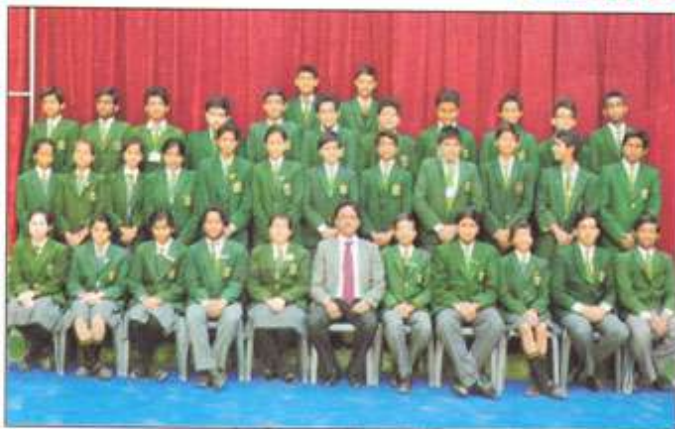
Class - 10 (A)