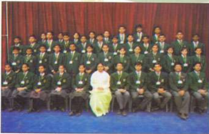
Class - 9 (A)