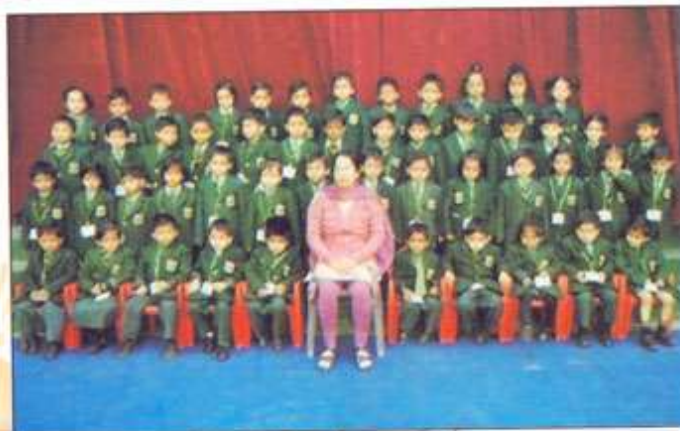
Class - Nursery (B)