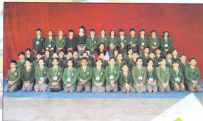
Class - 3 (B)