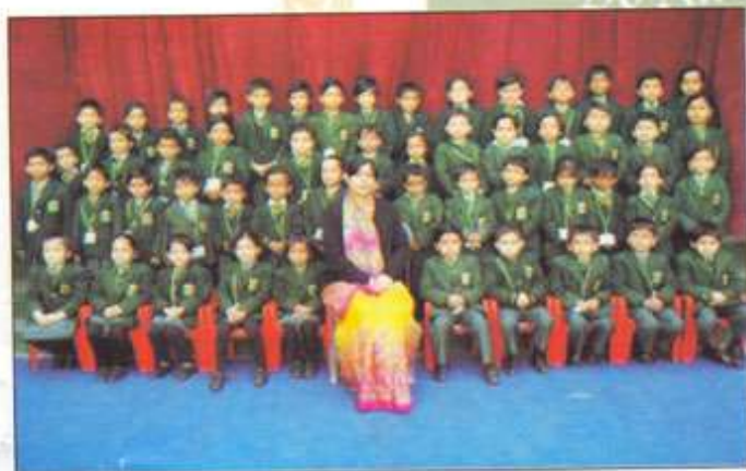
Class - K.G. (A)