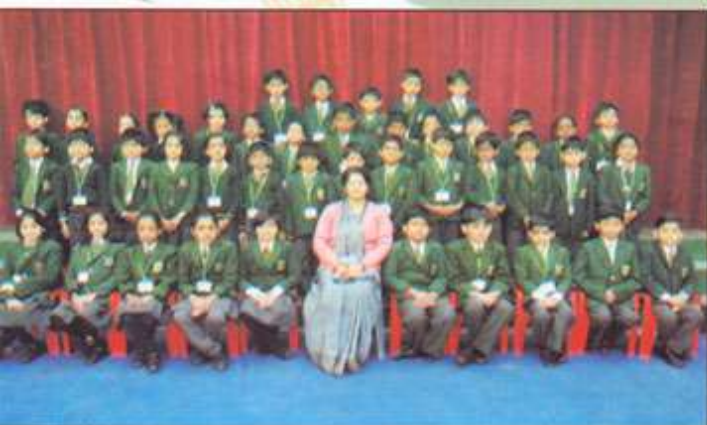
Class - 1 (A)