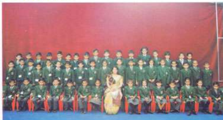
Class - 1 (B)