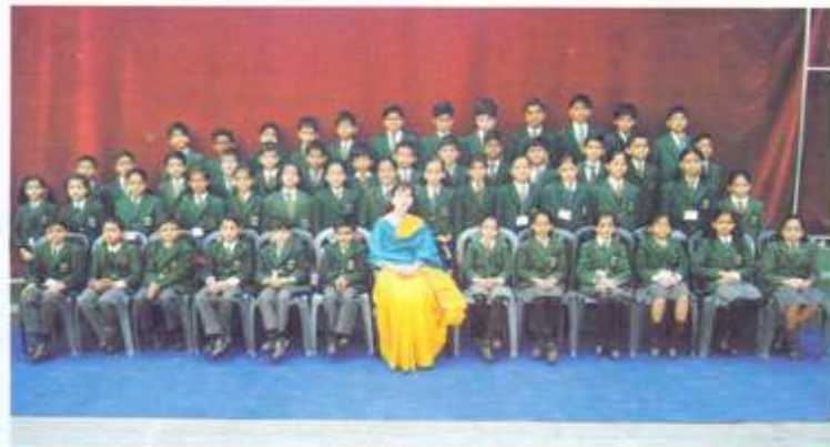
Class - 4 (B)