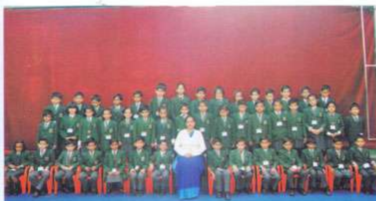
Class - 2 (A)