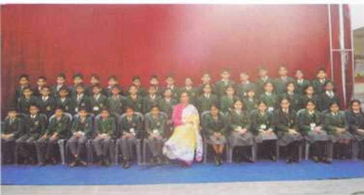
Class - 5 (A)