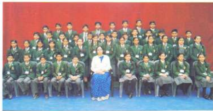
Class - 7 (B)