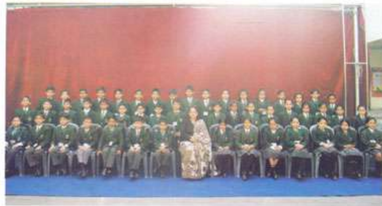
Class - 3 (B)