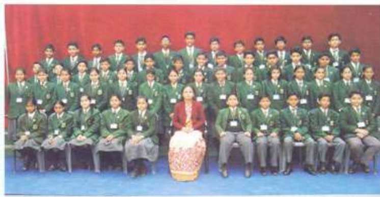
Class - 8 (B)