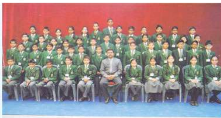
Class - 6 (B)