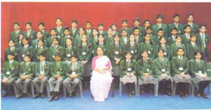
Class - 8 (A)