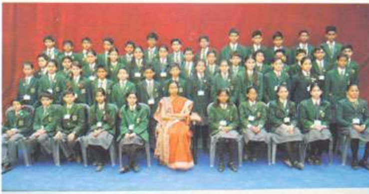
Class - 7 (A)