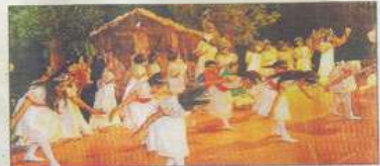
Students of St Teresa School performing a dance during the annual concert on Monday.