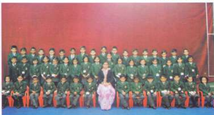
Class - 1 (A)