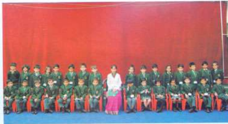
Class - Prep (C)