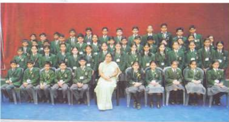
Class - 6 (A)