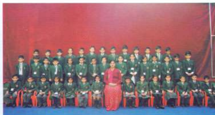
Class - 2 (B)