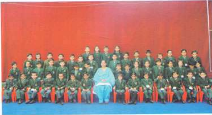
Class - Prep (A)