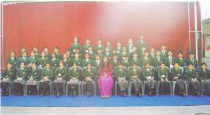
Class - 4 (A)