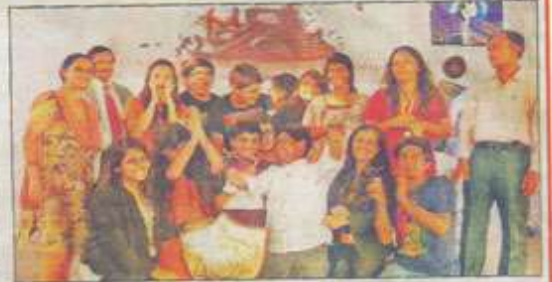
गल्स विनर टीम

सेंट टेरेसा डे स्कूल एंड कॉलेज महिला हाउस में हुई इण्टर स्कूल संगीत प्रतियोगिता 'न्यूक वॉक्स' में लामार्टीनियर गल्स कॉलेज और स्टडी हॉल ओवर ऑल विनर रहे। आशियाना में आयोजित इस प्रतियोगिता में सेंट प्रॉक्सिम कॉलेज, स्टडी हॉल, इटैला मारिन सेंट मैरिस कान्पेट और टेरेसा कॉलेज ने भाग लिया था। प्रतियोगिता का आयोजन दो वर्गों में किया गया। जिनमें से कॉलेज वर्ग में स्टडी हॉल विनर और लामार्टीनियर गल्स कॉलेज रनरअप