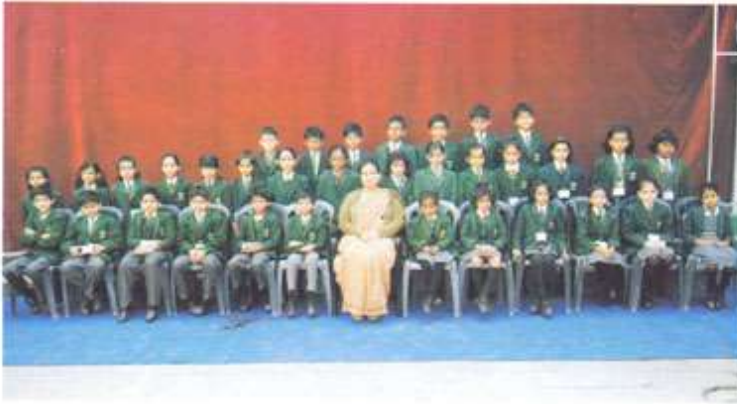
Class - 3 (A)