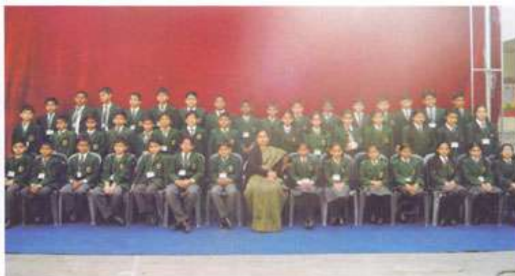
Class - 5 (B)